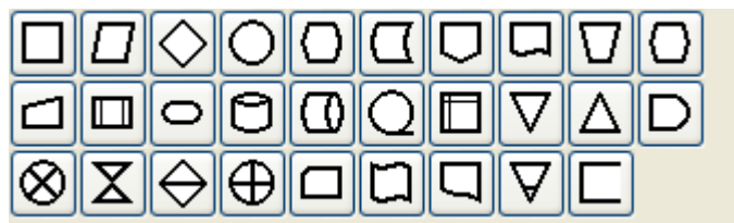
Figure 6.7: Flowchart

A group dedicated to providing the user shapes which are commonly used in flow charts. Flow charts can be routinely found in computer programming, marketing, economics, and any other semi-linear operation which requires planning. Most flowchart objects allow entry of text.