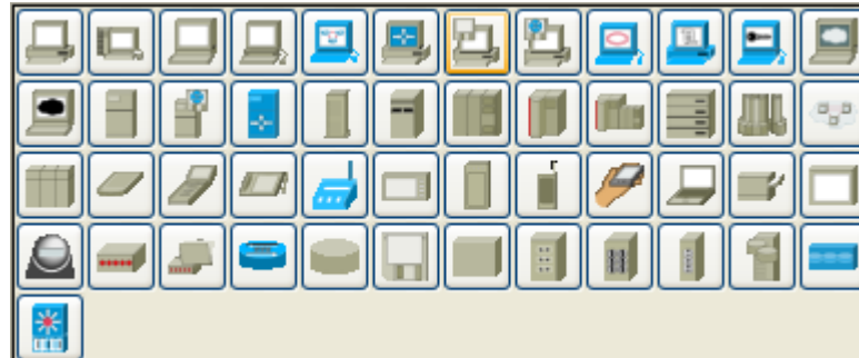
Figure 6.2: Cisco - Computer

Cisco - Computer includes shapes representing computer equipment from Cisco, a manufacturer of Computer Networking Equipment.