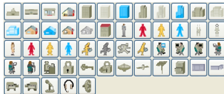
Figure 6.3: Cisco - Misc

Cisco - Misc includes miscellaneous shapes from Cisco, a manufacturer of Computer Networking Equipment.