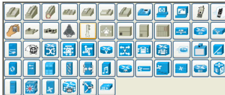
Figure 6.6: Cisco - Telephony

Cisco - Telephony includes shapes representing telephony equipment from Cisco, a manufacturer of Computer Networking Equipment.