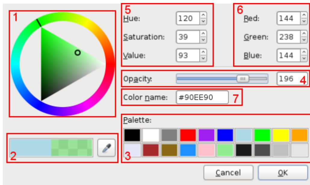
Figure 4.39: Select Color Box

The Colors selector box contains 7 zones: