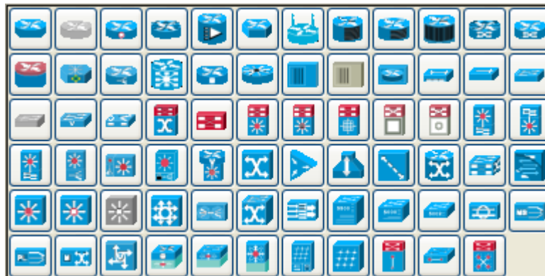
Figure 6.5: Cisco - Switch

Cisco - Switch includes shapes representing switch equipment from Cisco, a manufacturer of Computer Networking Equipment.