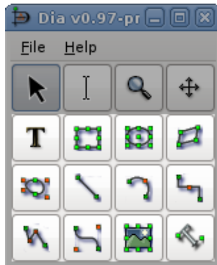
Figure 5.1: Basic Objects

Dia has a dozen basic objects: Text, Box, Ellipse, Polygon, Bezierngon, Line, Arc, Zigzagline, Polyline, Bezierline, Image and Outline.